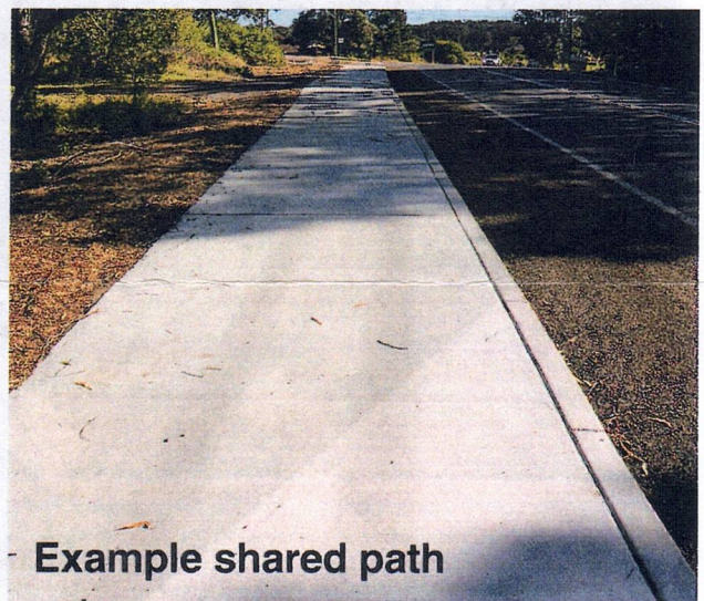
Example shared path